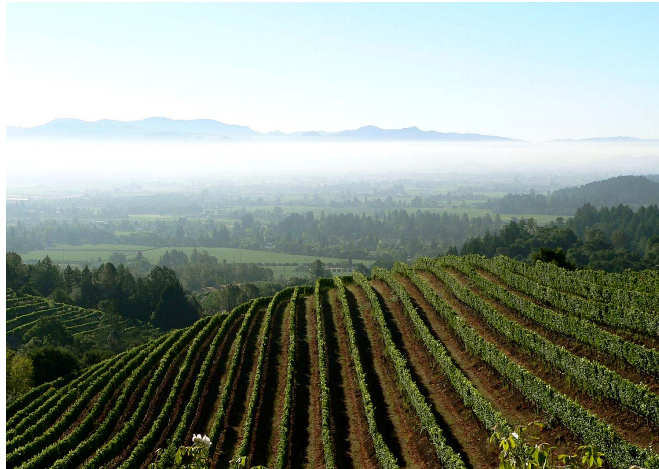
HILLSIDE VINEYARDS IN NAPA COUNTY

CONTACT: PATRICK LOWE 707/259-5937 RLOWE@CO.NAPA.CA.US