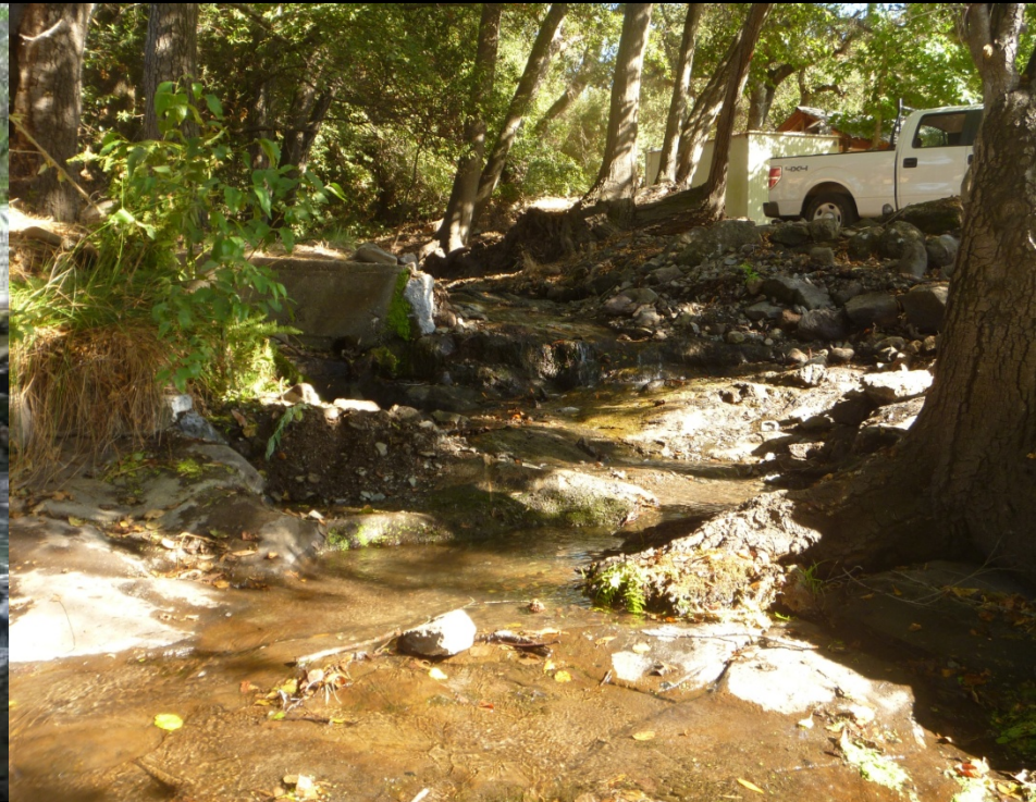
After (During Low Flow)