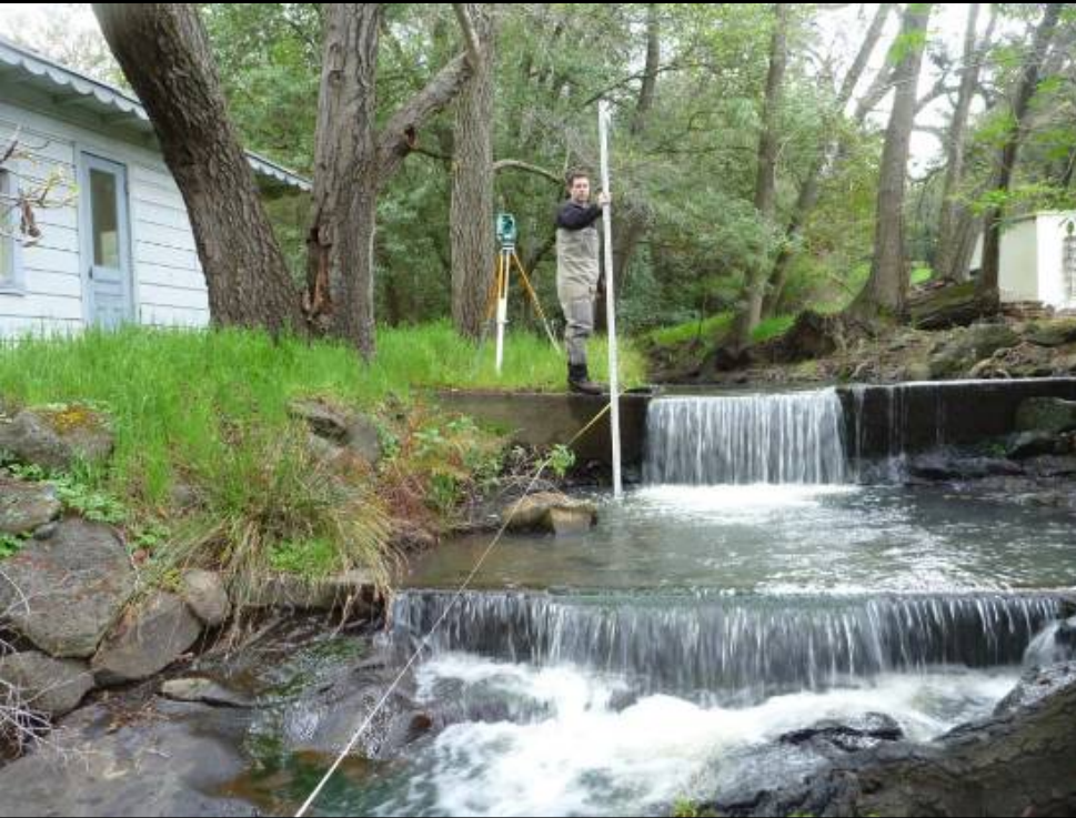
Before (During High Flow)