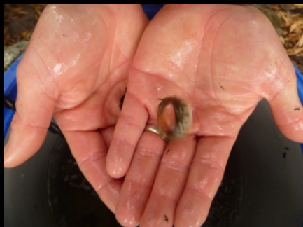
Prickly sculpin (Cottus asper)