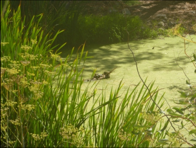
Pacific Pond Turtle ( Actinemys marmorata )