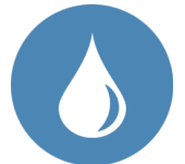
Improved Water Supply and Quality