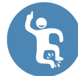
Improved Quality of Life