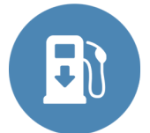
Reduced Fossil Fuel Reliance