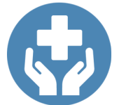
Improved Public Health