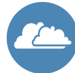
Improved Air Quality

GHG reduction and adaptation measures will provide other important environmental and economic benefits to the community, or co-benefits. Co-benefits are the unintended positive side effects that result from strategies and measures identified in the CAP. The County has identified the following 10 co-benefits.