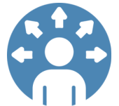
Increased Public Awareness of Climate Change