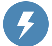
Lowered Energy Demand