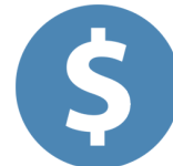
Lowered Energy, Water, and Sewer Bills