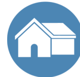
Protection of Structures and Assets