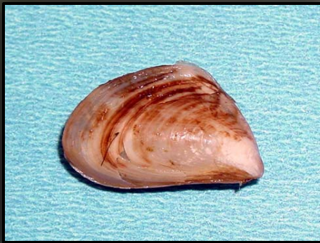
Quagga Mussels ( Dreissena rostriformis bugensis )