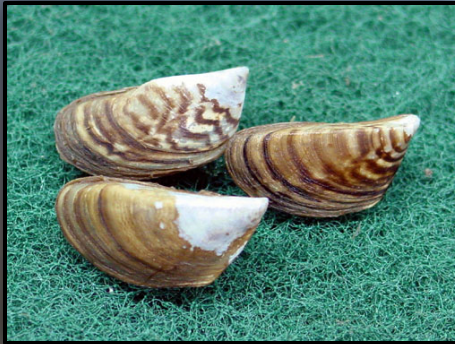
Zebra Mussels ( Dreissena polymorpha )