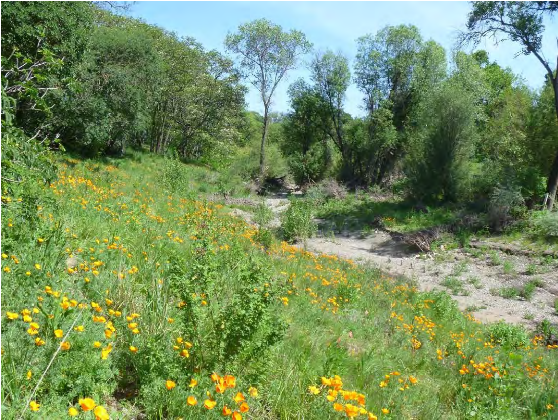
Reach 8A, April 2014