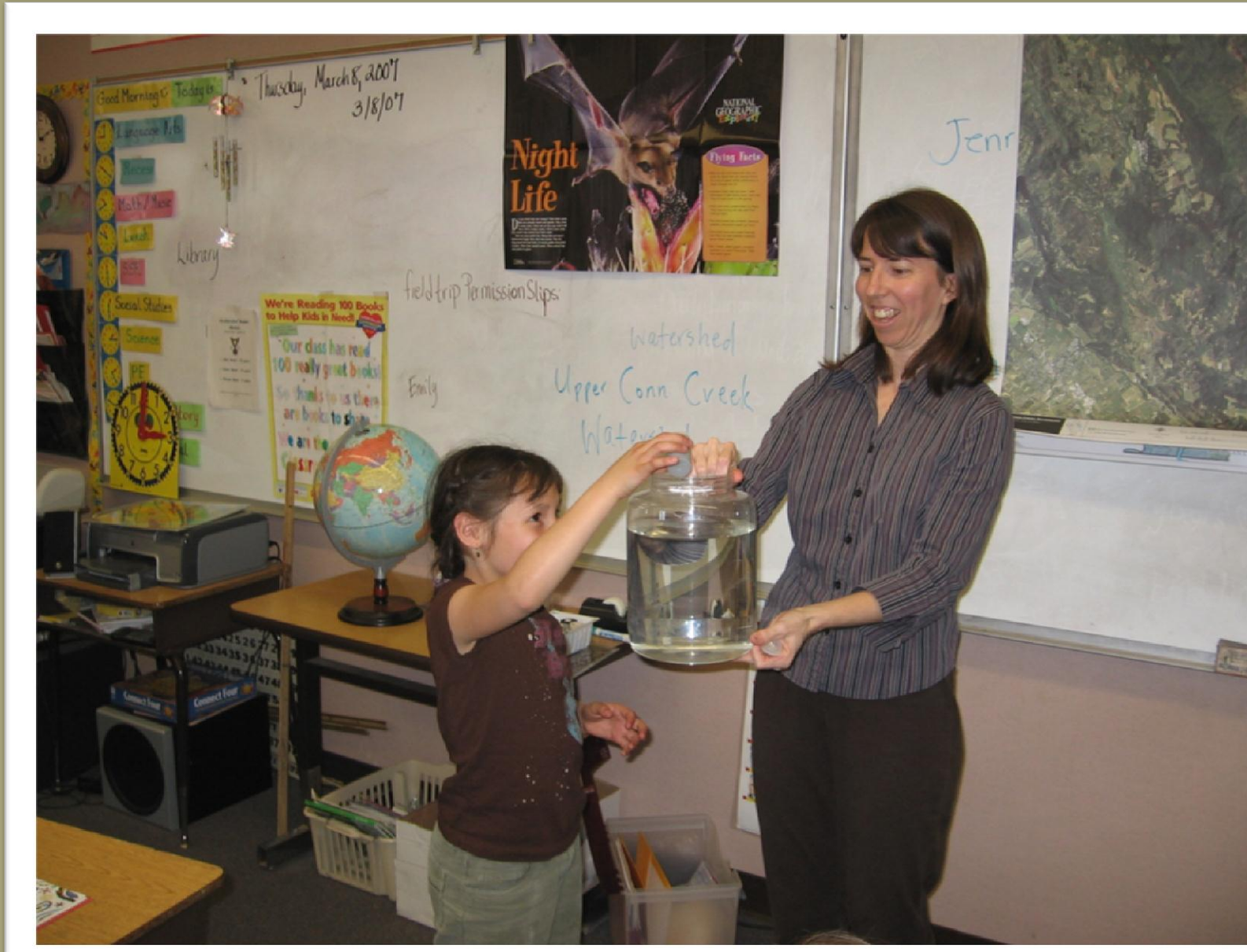
NCSPPP provides funding for 10-30 classroom presentations per year that focus on stormwater pollution prevention.