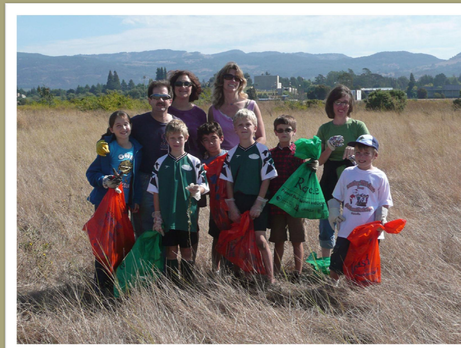
Napa RCD staff coordinated volunteer cleanups at 12 sites in Napa County and collected five tons of trash and over three tons of recyclables with 554 volunteers. A total of 15 miles of waterways were cleaned.