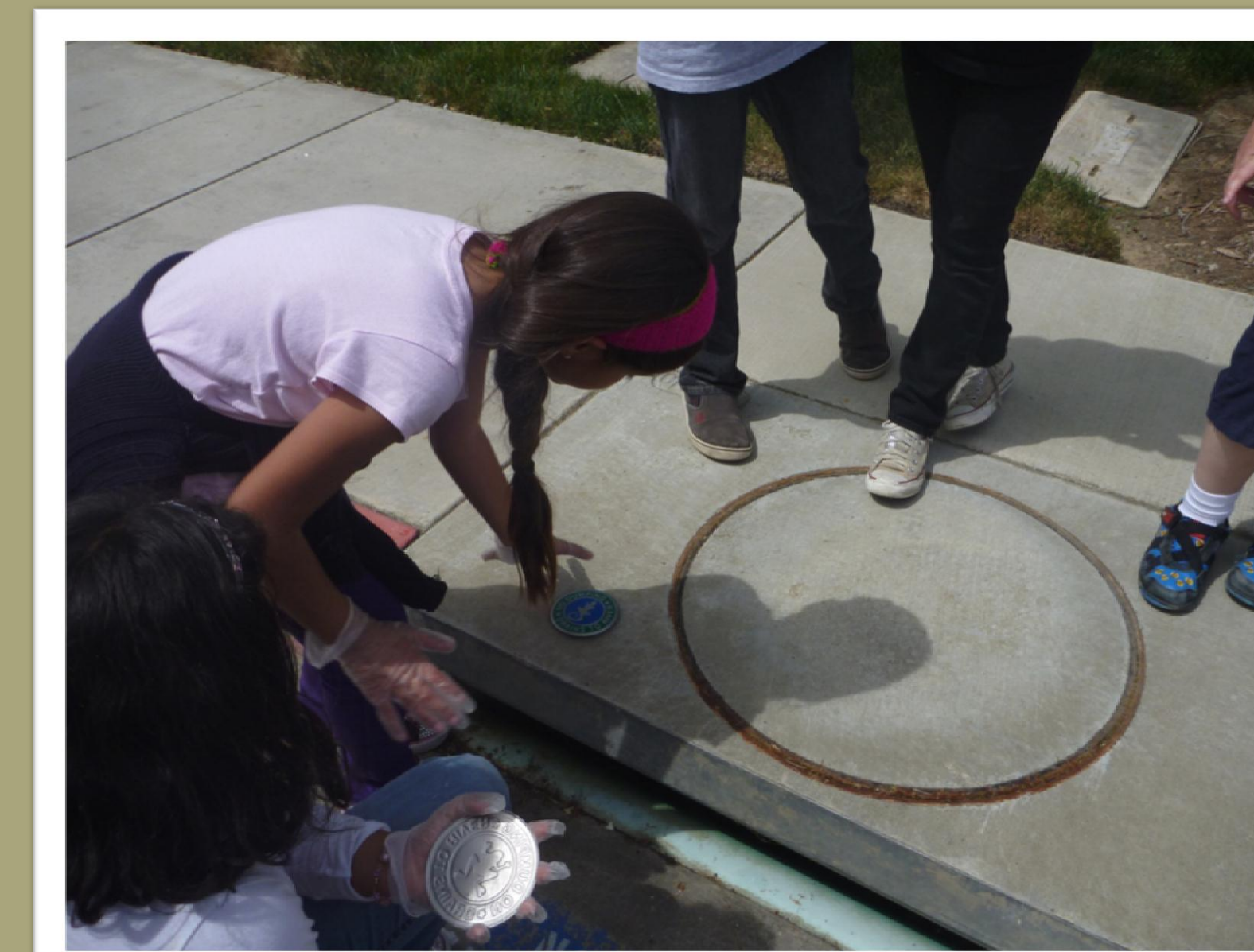
With funding provided by the NCSPPP, Napa RCD staff coordinated storm drain marking events with local students. Students marked roughly 100 drains with plaques reading, "No dumping, drains to river."