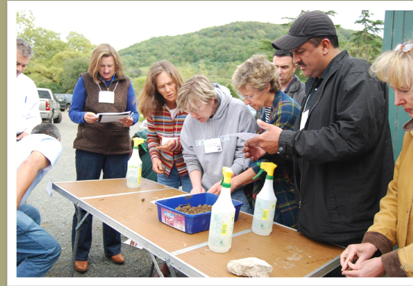
NCSPPP co-sponsored a 7-class series on "Bay-Friendly Landscaping for the Landscape Professional." These classes were attended by 41 local and regional landscape architects and landscape maintenance personnel.