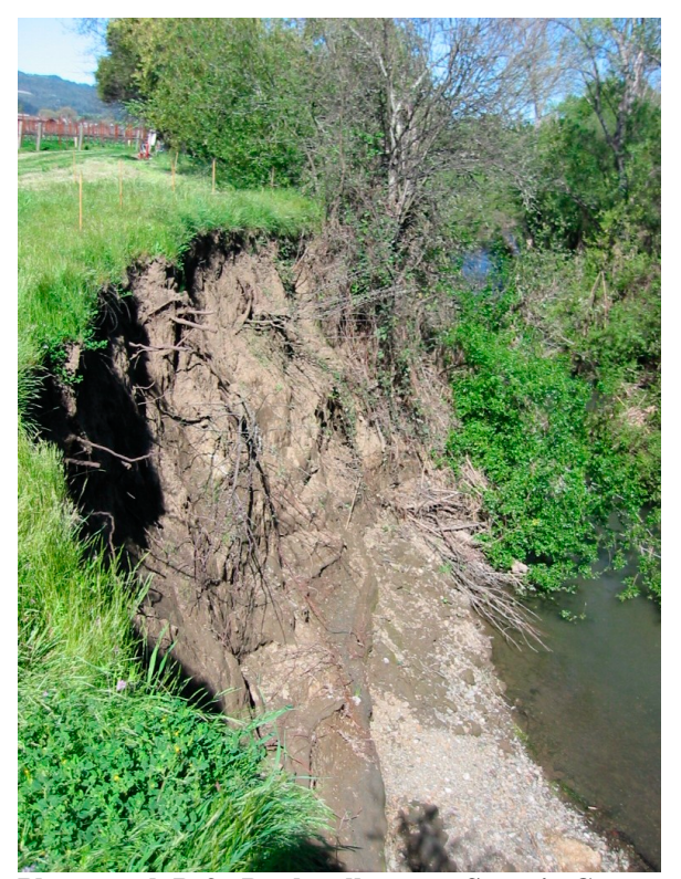
Photograph B-3. Bank collapse on Sequoia Grove property One of the priority restoration sites, this reach is stage 5, but receives impinging flows.