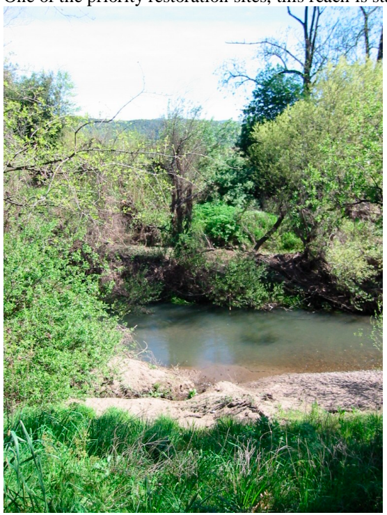
Photograph B-4. Looking from Sawyer to Wilsey properties