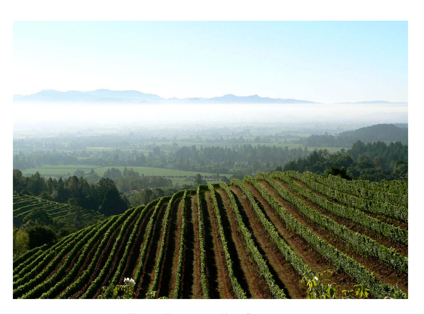
HILLSIDE VINEYARDS IN NAPA COUNTY

CONTACT: PATRICK LOWE 707/259-5937 RLOWE@CO.NAPA.CA.US