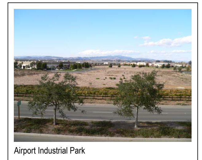
Airport Industrial Park

Table 9-1 provides a detailed land use breakdown for the unincorporated areas of the County. This summary includes a breakdown of land uses by land use category, treating separately land that is currently developed from and land that is designated in that category but is currently categorized as vacant/undeveloped. It is important to note that the Napa County GIS does not contain detailed land use information for areas within the five incorporated cities/towns within Napa County. Since data for the incorporated areas of the County is not available through the County's GIS, data for these areas were collected through contacting city/town planning departments and using information from each incorporated area's General Plan.