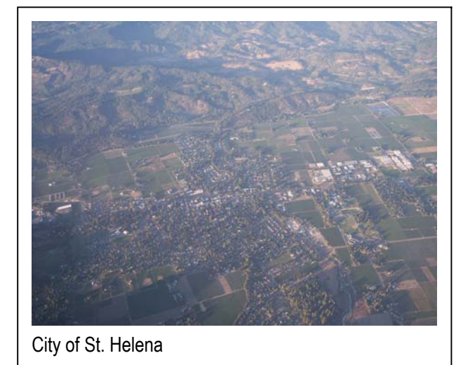
City of St. Helena