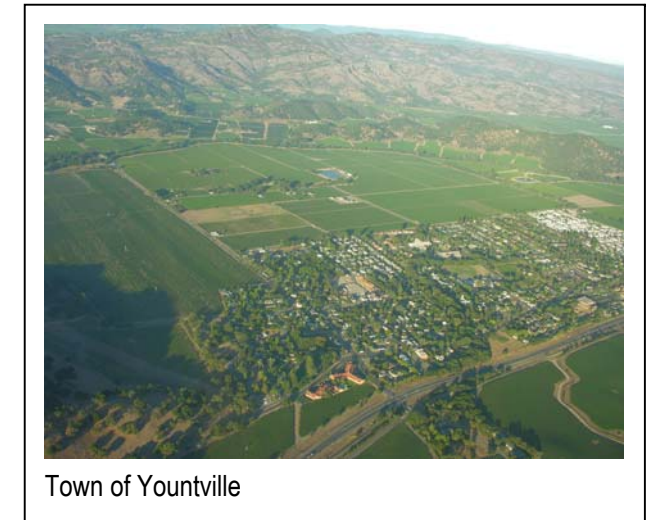
Town of Yountville

The City of Calistoga is the northernmost incorporated area in Napa County, located at the northern end of the Napa Valley Floor. The area within the City's limits consists of approximately 2.5 square miles and is mostly located on the Napa Valley floor. Calistoga is a small city, with a population of approximately 5,200, according to the 2000 Census. The City's SOI is coterminous with the City limits. The Planning Area covers a much larger area than the City limits, and extends nearly to the ridgelines east and west of the City.