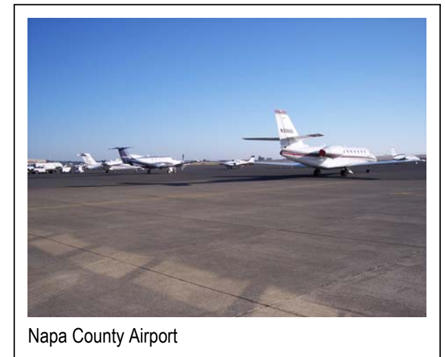
Napa County Airport

A key objective of LAFCO includes the orderly formation of local government agencies that balance the competing needs in California for efficient services, affordable housing, economic opportunity, and conservation of natural resources. Other objectives include preserving agricultural land resources and discouraging urban sprawl.