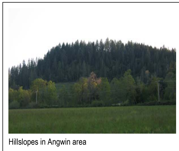
Hillslopes in Angwin area

The Southern Interior Valleys Evaluation area is located in the southeastern portion of Napa County, bordering Solano County. Highway 121 runs through the western portion of the evaluation area. Lake Curry is located in the central portion of the evaluation area, and Suisun Creek drains from Lake Curry,