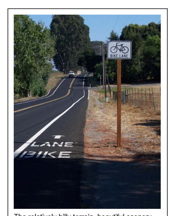
The relatively hilly terrain, beautiful scenery, and mild weather in Napa County make a physically challenging, yet attractive atmosphere for recreational cyclists.

Napa County is home to both recreational cyclists and cyclists who use their bicycles for commuting. The relatively hilly terrain, beautiful scenery, and mild weather in Napa County make a physically challenging, yet attractive atmosphere for recreational cyclists. Cities in the County are typically relatively flat and provide a reasonable atmosphere for cycling. However, the distance between urbanized areas make inter-city travel via bicycle more difficult. The County roadway system includes off-street trails and paths, as well as on-street bicycle lanes and routes. Bicycle facilities are generally organized into the following groups: