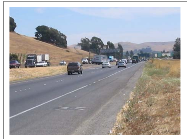
Approximately 88% of Napa County residents commute in automobile. This is consistent with California (86% automobile commute) and overall U.S. (88% automobile commute) trends.