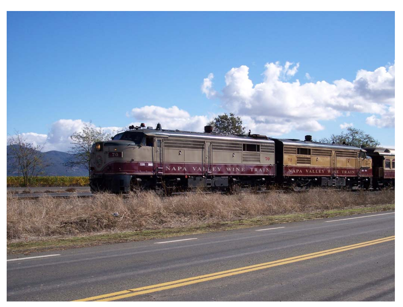
NAPA VALLEY WINE TRAIN