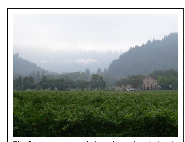
The County attempts to balance its rural, agricultural identity with likely growth in development and tourism.