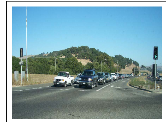
Roadways in Napa County range in size and function from major freeways to residential streets.