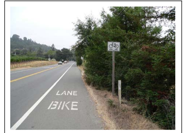
Napa County has a number of off-street trails and paths, as well as on-street bicycle lanes and routes.

Table 11-11, which shows the primary collision factors for these collisions, indicates that 32% of bicycle-related collisions in Napa County during the 3-year analysis period were directly associated with cyclists riding on the wrong side of the road. Another 17% were related to automobile right-of-way violations.