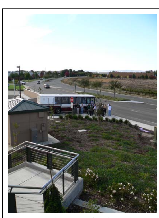
The transportation system should minimize disruption to residential neighborhoods and communities.

side vehicular and pedestrian traffic. As discussed in Chapter 2, as the level of the "strip commercial" development increases, along with its associated driveways (mostly unsignalized intersections), roadway capacity decreases. Therefore, the approval of new or expanded developments should continue to be contingent upon a proper analysis of potential impacts relating to the development, especially with respect to driveway location and spacing with respect to other driveways and crossing roadways. Said controls and assessments should not be limited only to SR 29 and Silverado Trail, but should be applicable to other local arterial roadways. It would be appropriate to implement such controls in concert with Policy Guidelines 2a and 2d, and with the Goals and Policies of the Land Use Element.