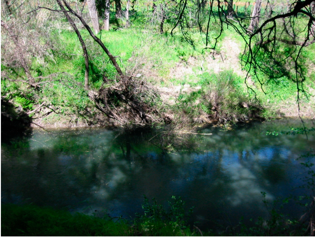
Photograph B-51. Tree roots exposed by incision, Quintessa opposite Sutter Home