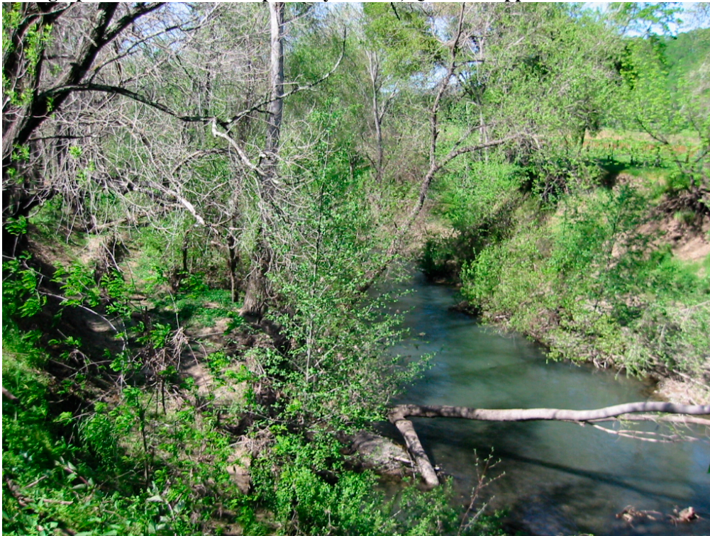
Photograph B-52. Bioengineered terrace on Sutter Home, bank erosion on opposite upstream Quintessa bank