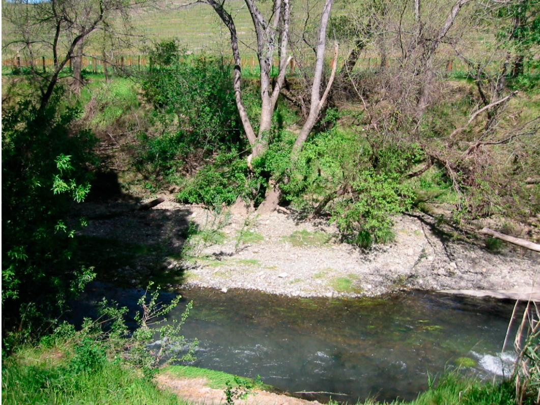
Photograph B-49. Terraces on stage 5 Quintessa reach opposite upper end of Frogs Leap