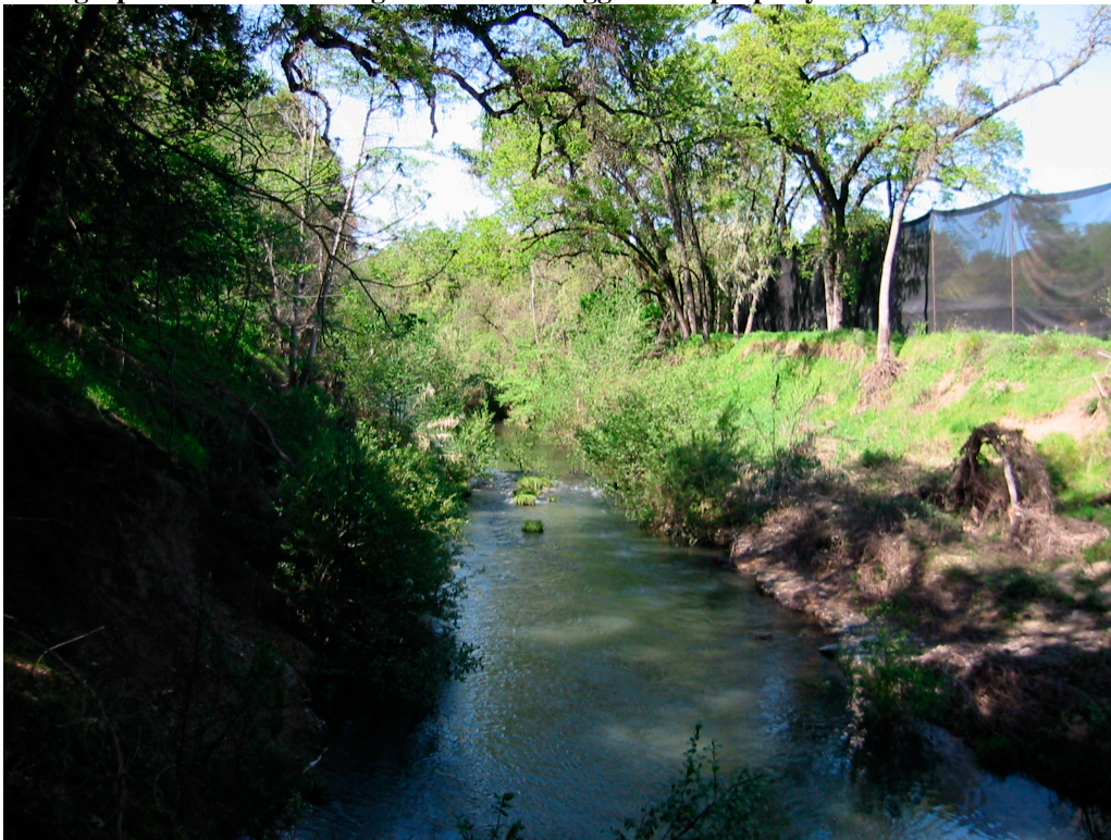
Photograph B-54. Incised stage 4 reach, Guggenhime/Quintessa boundary