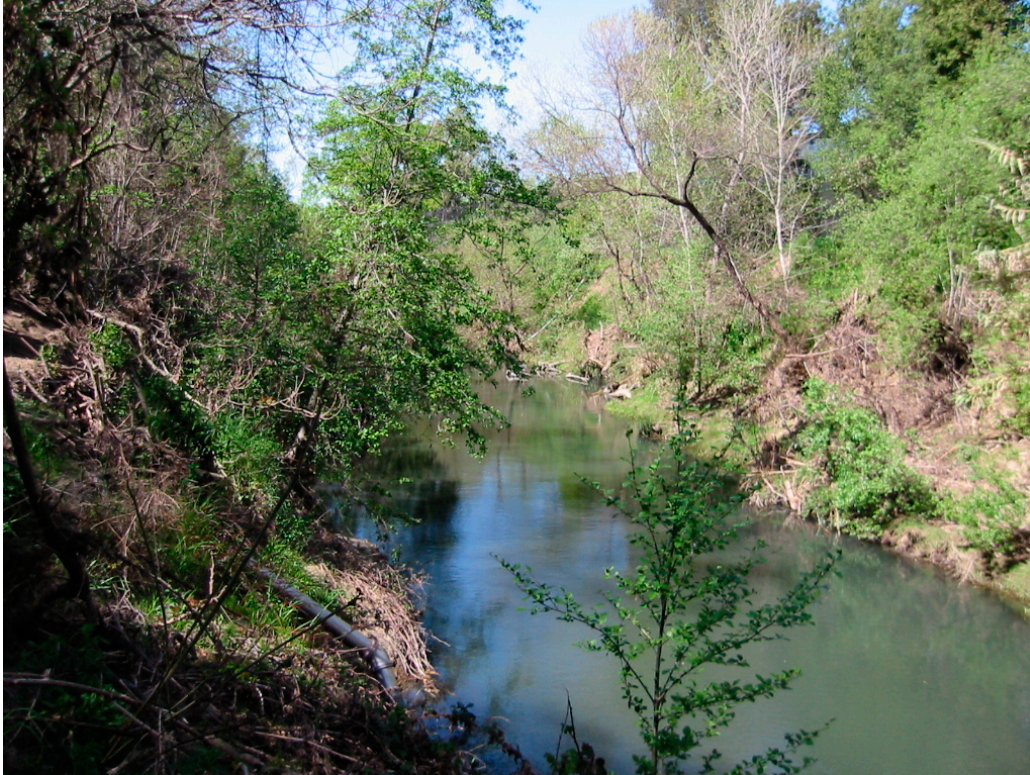
Photograph B-53. Incised stage 4 reach on Guggenhime property