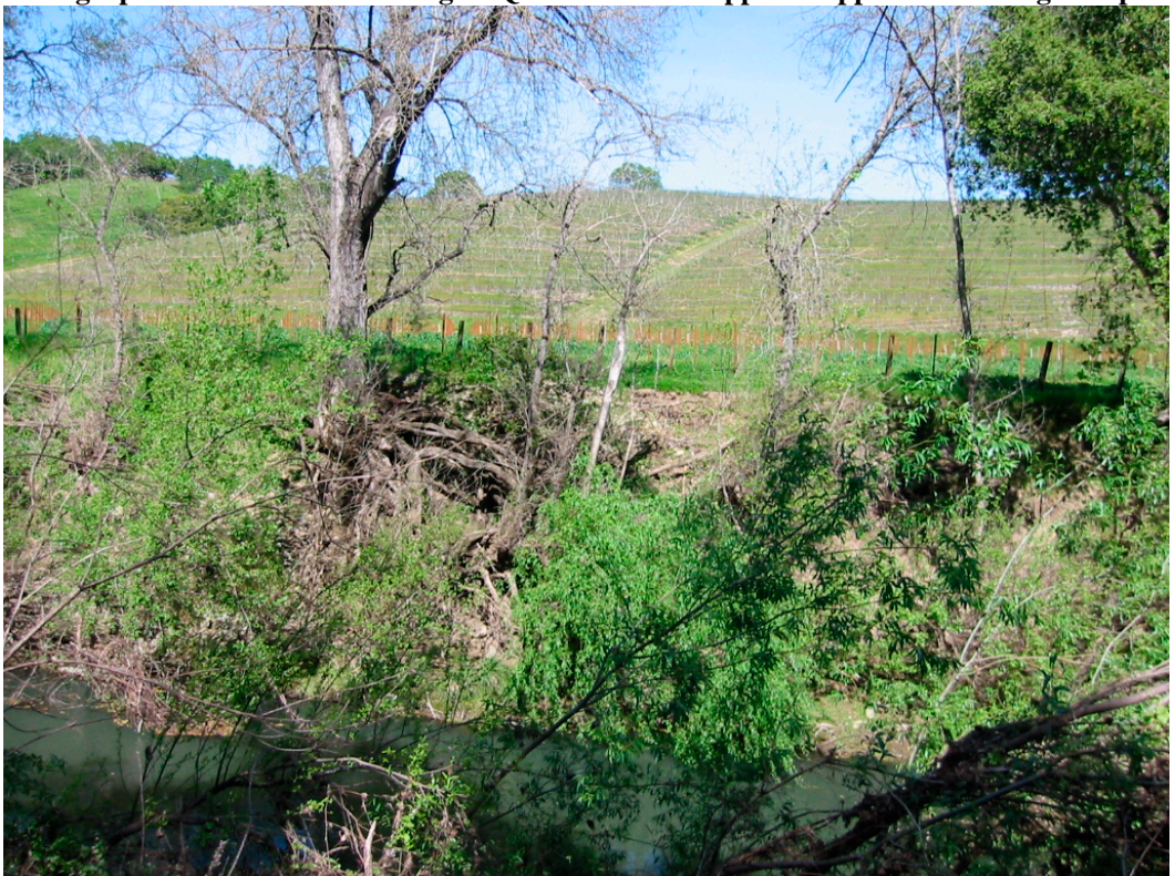
Photograph B-50. Undercut mature trees on the east bank of a stage 4 reach, mid section of Quintessa