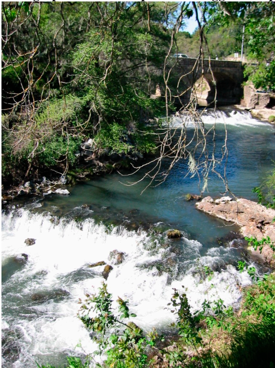
Photograph B-56. Knickpoints on Guggenhime property south of Zinfandel Lane Bridge