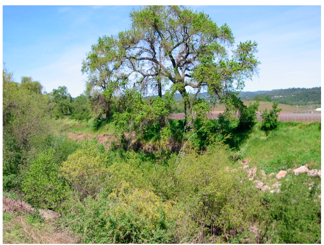
Photograph B-35. Incised stage 4 channel with bank top erosion, Carpy Connoly The northern boundary of the main priority reach.