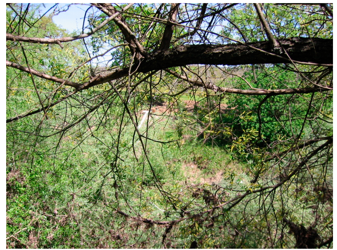
Photograph B-39. Looking across the riparian woodland from C Mee to Carpy Connoly, stage 5