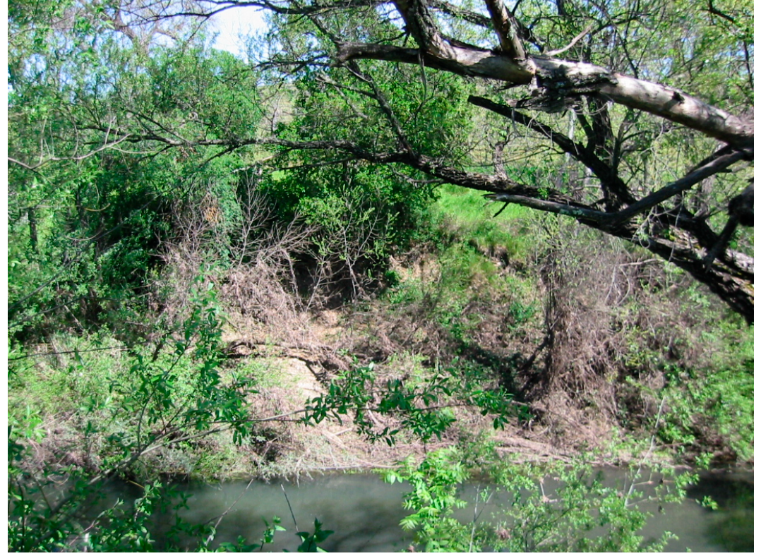
Photograph B-40. Local bank erosion on the east bank, Carpy Connoly