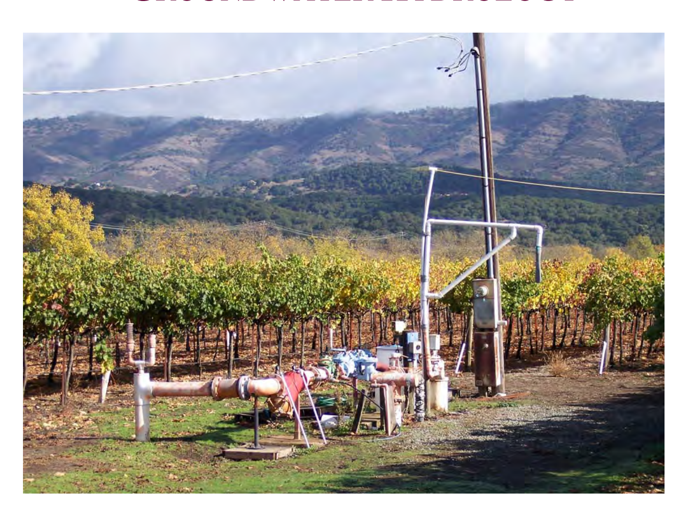
GROUNDWATER WELL, PUMP, AND DISTRIBUTION PIPES