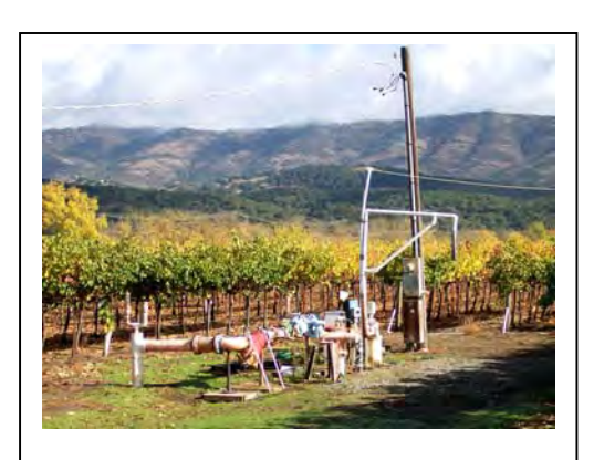
Approximately 92% of the land under irrigation in the County is used for vineyards. Water for irrigation and frost protection are the most significant uses of groundwater in the County.