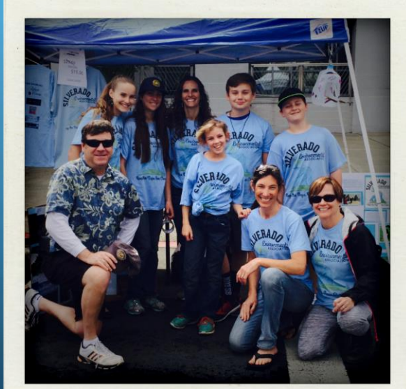
S.E.A. EARTH DAY 2015