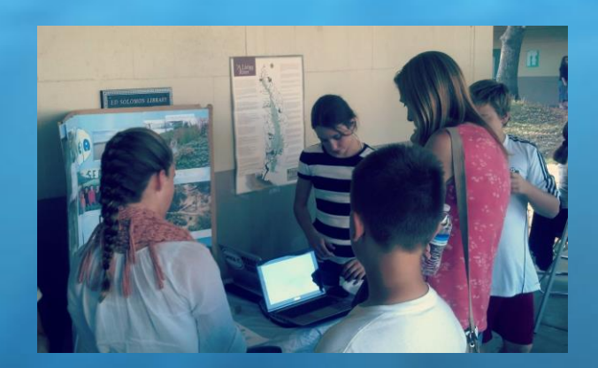
Presenting at School Events