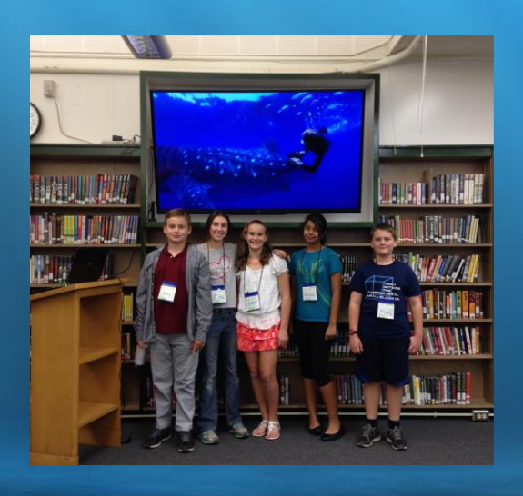
Movie Night Fundraisers & Community Education