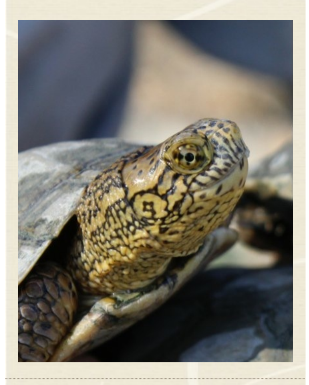
ACTINEMYS MARMORATA ACTINEMYS PALLIDA