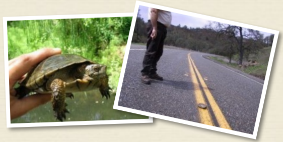
Although western pond turtles are most vulnerable when they leave the water, they usually head for dry land with a purpose.

Western pond turtles leave the safety of the water more often than you might think. Turtles come to land to nest; escape drying creeks and ponds or winter floods; hibernate; find mates; and to seek out new ponds and streams.