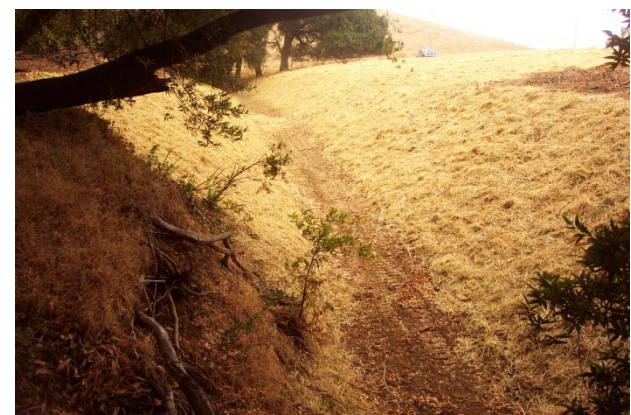
Before and after road decommissioning, Carneros Creek watershed