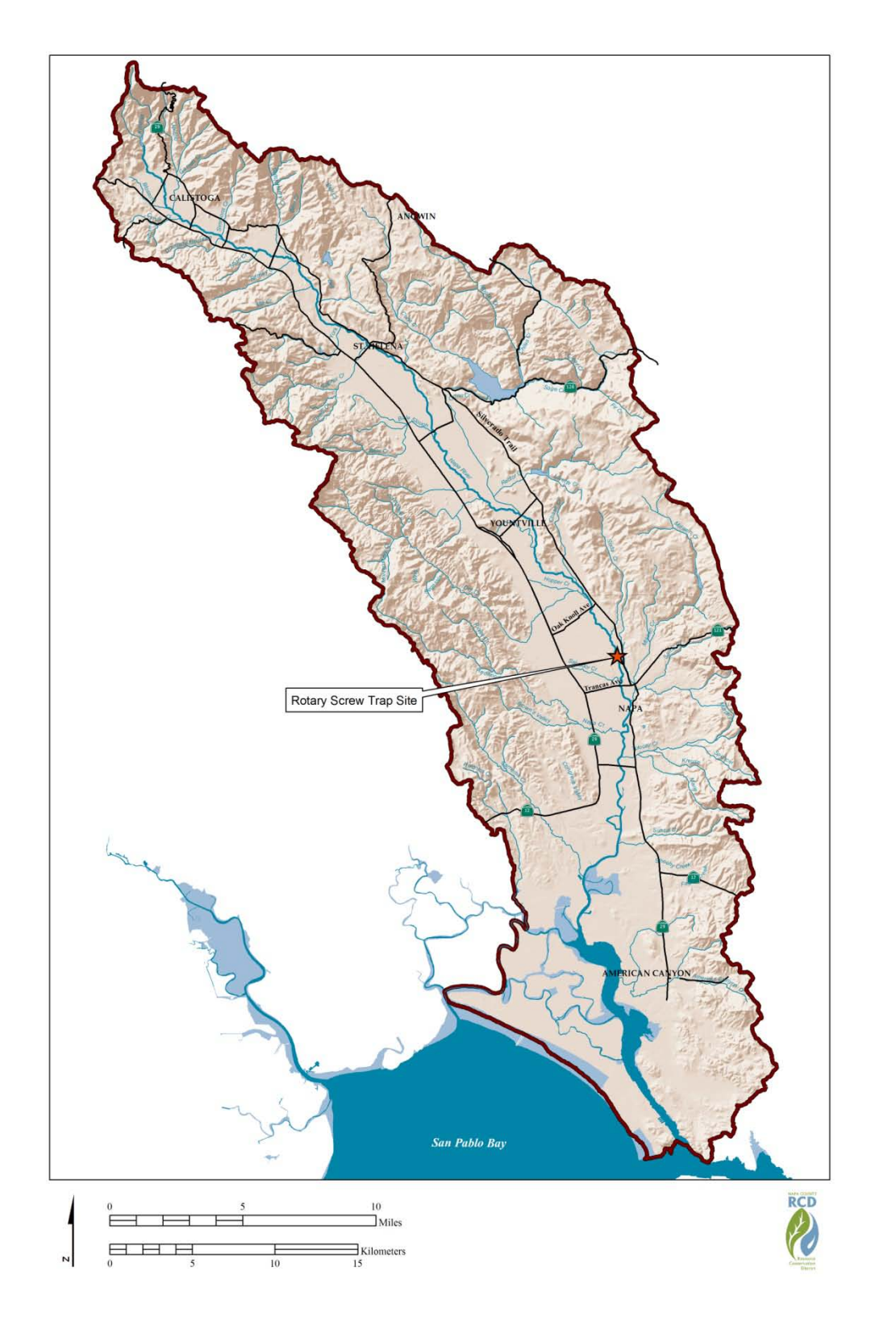
Figure 1. Rotary screw trap monitoring site located on the mainstem Napa River approximately two miles downstream of the Oak Knoll Avenue Bridge.