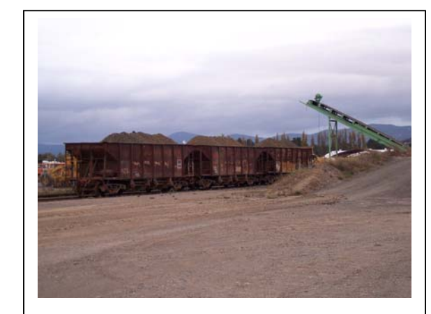
Aggregate and building stone from quarries are the most economically valuable mineral resource currently produced in Napa County.

There are also a number of abandoned quarries within the County (Selleck pers. comm.). Although there are four currently "active" mines in Napa County, only one—Napa Quarry—is a significant mine, according to the OMR (2005) and local mine owners/operators. Napa Quarry (formerly the Basalt Rock Quarry), the sole major operational quarry in Napa County, is located on hill slopes just southeast of the City of Napa. The quarry first opened in the early 1900s. The material mined in the quarry is basalt from flow rocks of the Sonoma Volcanics. The processed basalt rock is suitable for use as concrete