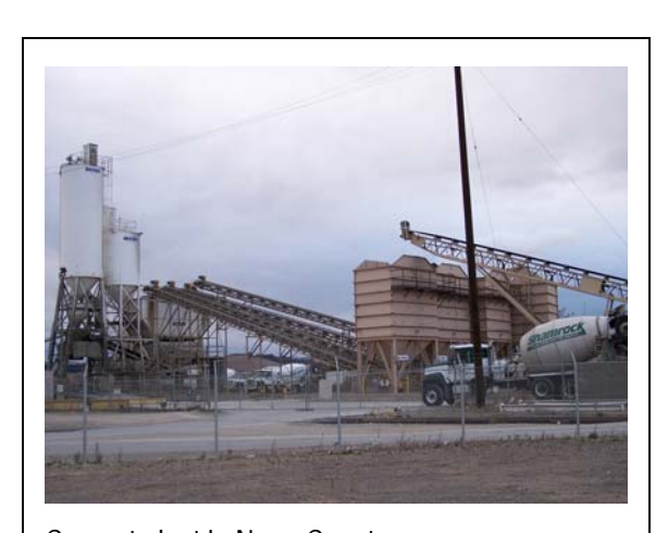
Cement plant in Napa County

Historically, Napa's two most valuable minerals were mercury, or quicksilver, and mineral water.