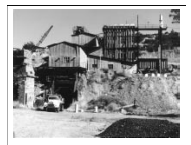
Historic Manhattan mercury mine, 1862

The geologic opportunities for future mineral extraction in Napa County are not clearly known. As discussed above, MRZ zone maps do not exist for the bulk of the County. Such maps would provide good insight into the potential for mineral extraction (aggregate only) within the County. The California