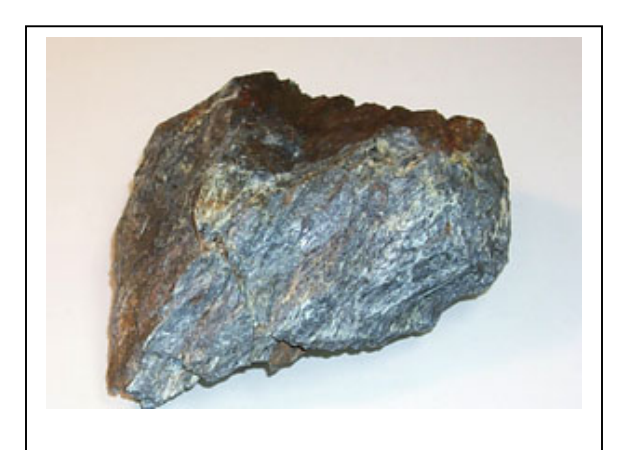
Serpentine, the California State rock and an abundant mineral in the Coast Ranges

Historically, mercury and mineral water have been the most valuable mineral resources in Napa. Currently, building stone and aggregate are the most valuable commodities.