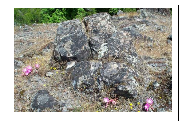
Basalt rock in Napa County

State of California, Office of Mine Reclamation. 2005. Website available at <a href="https://www.consrv.ca.gov/OMR/">www.consrv.ca.gov/OMR/</a>>. Last accessed: August 2005.