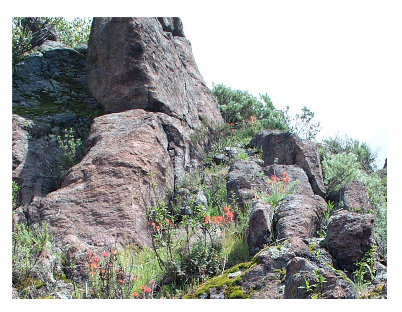
SERPENTINE OUTCROP WITH PAINTBRUSH