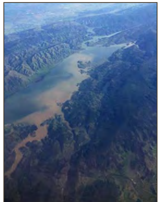
Sediment plume at Lake Berryessa

Through a project website, a series of stakeholder meetings and public workshops, online mapping, and other resources, the project will: