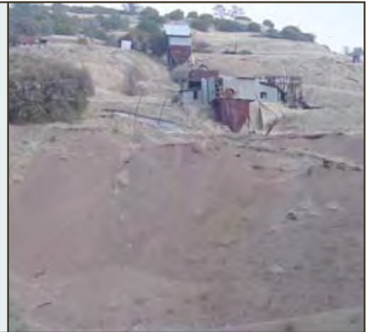
Photo: Abbott-Turkey Run mine site by Hwy. 20 prior to cleanup