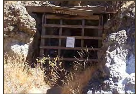
Abandoned mine entrance