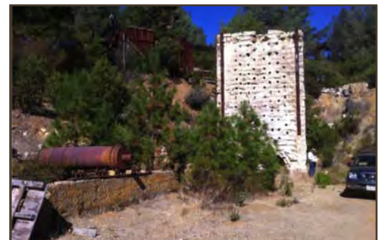
Legacy mine site structures, Corona Mine