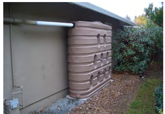
Large unit installed at a single family residence.