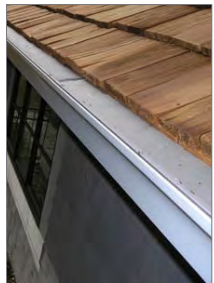
This gutter is covered by a fine mesh gutter guard to keep debris out.