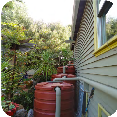
Daisy chained system of 205-gallon rain barrels

Rain barrels and cisterns can be installed to capture stormwater runoff from rooftops and store it for later use. They are low-cost systems that will allow you to supplement your water supply with a sustainable source and help preserve local watersheds by detaining rainfall.