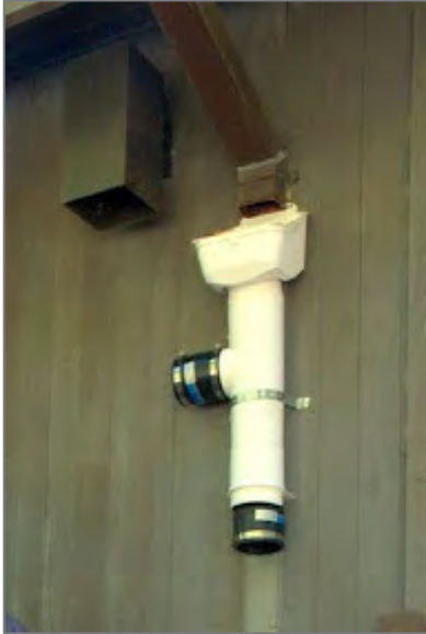
First flush and downspout diverter installation

Various accessories to rain barrels and cisterns help protect the quality of harvested water and reduce maintenance. These accessories include “first flush” diverters, filters, and screens.