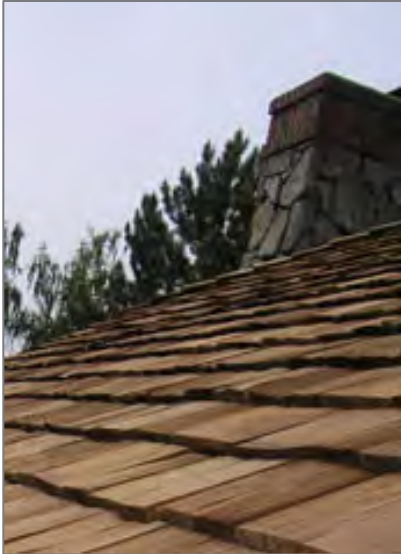
Wood shingle roof

Technically, any impervious surface can be used for harvesting rainwater; however, the surface materials will affect the quality of captured rainwater, which has implications for the recommended uses.