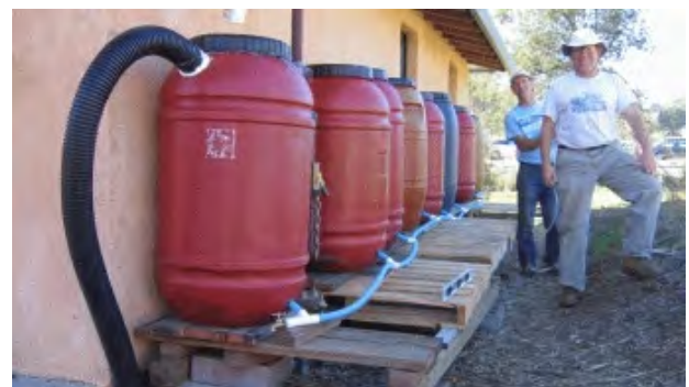
Daisy-chained system

The City of Los Angeles and Geosyntec Consultants are acknowledged for providing text and formatting used in this fact sheet. The City of Oakland, Acterra, Gutter Glove, and Stephanie Morris are acknowledged for images used in the fact sheet.